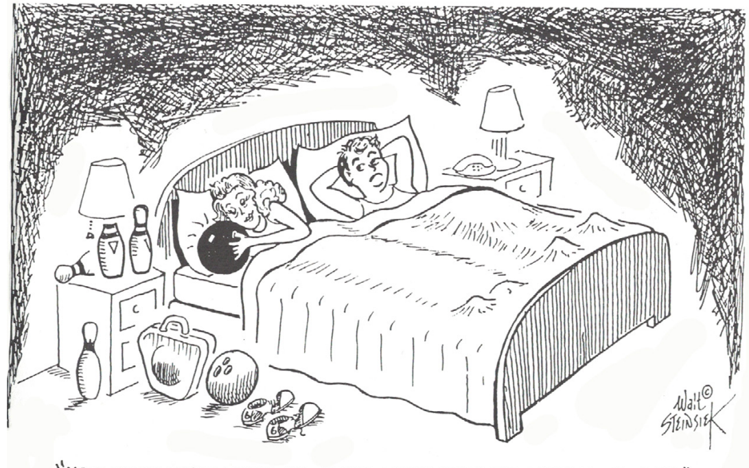
"NOW HONEY, WHAT MAKES YOU THINK I LOVE BOWLING MORE THAN YOU?"