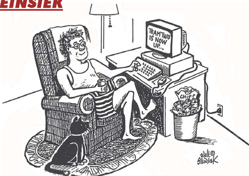
LEAGUE BOWLING ON THE INTERNET