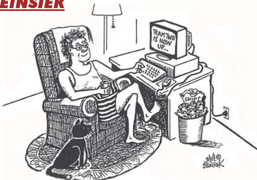
LEAGUE BOWLING ON THE INTERNET

Walt Steinsiek's "Cartoon of the Week" appears on this site.