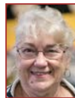
Dee Middle Arlington, Va.