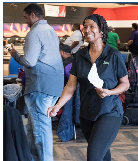
Agnes "Jazzy" Hopps