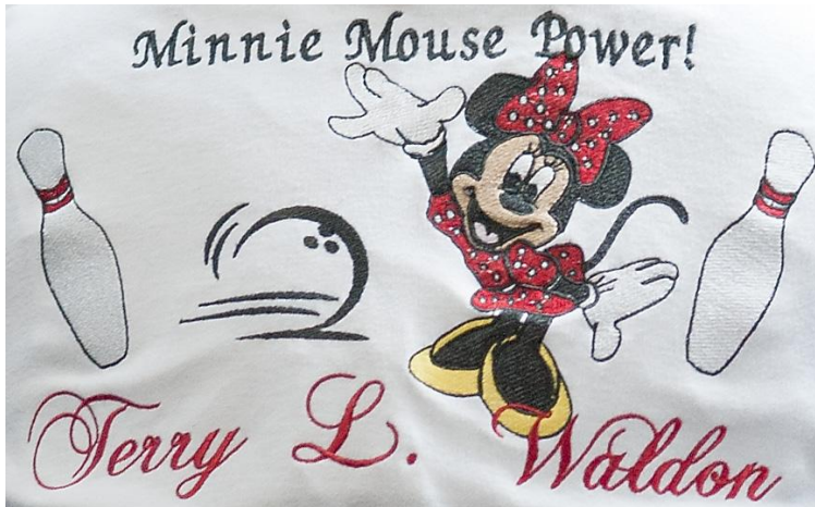
Colorful bowling shirts were worn by some of the participants.