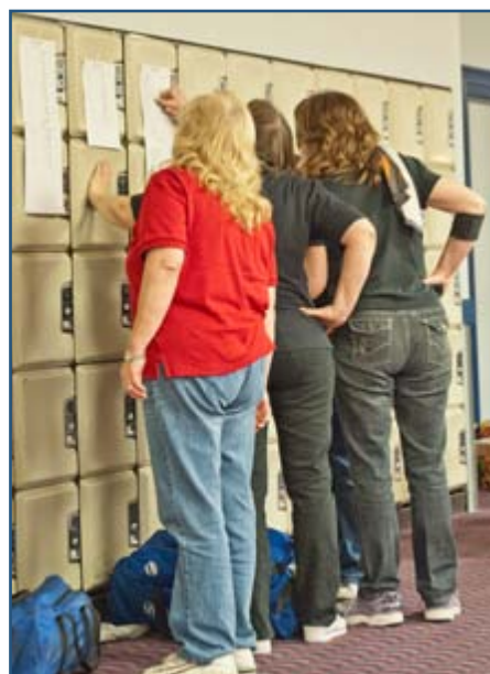
Bowlers check out the bracket lists.