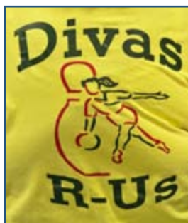
Many bowlers wore colorful and message-delivering shirts.