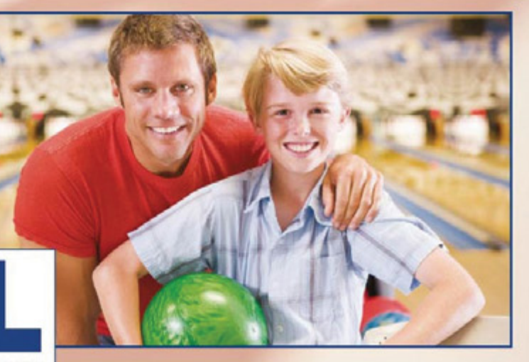
THE BOWLERS TO VETERANS LINK

Thanks to BVL, smiles, laughter, and joy are brought to those who have served our country. Your contribution can help us make a difference in the lives of America's active duty troops and veterans. Visit www.BowlforVeterans.org to learn more.